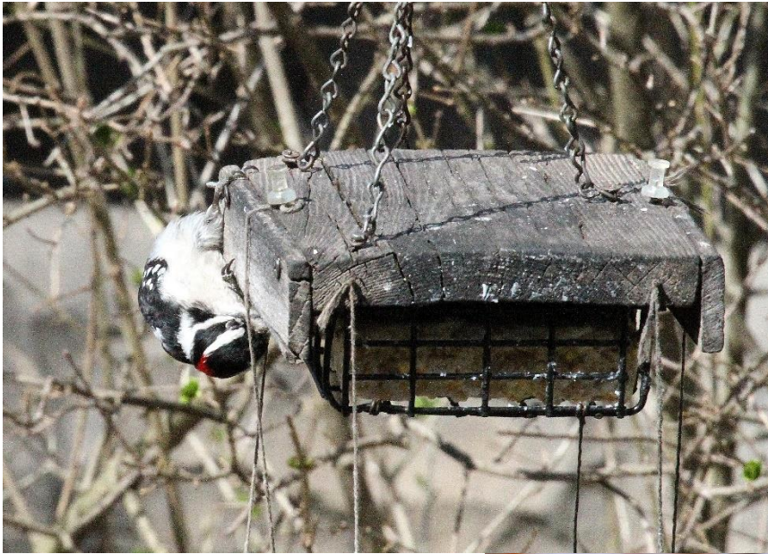
A male Downy Woodpecker clung to the side of my old suet feeder to peck out some morsels from a suet cake.