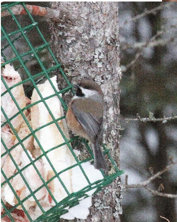
In Sax-Zim Bog, a Boreal Chickadee got energy from raw beef suet.