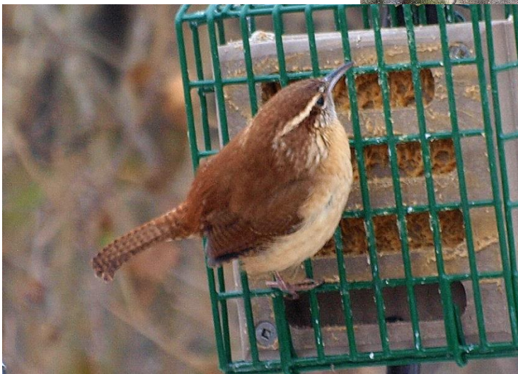
At home, the Carolina Wren was more successful at getting to the peanut butter.