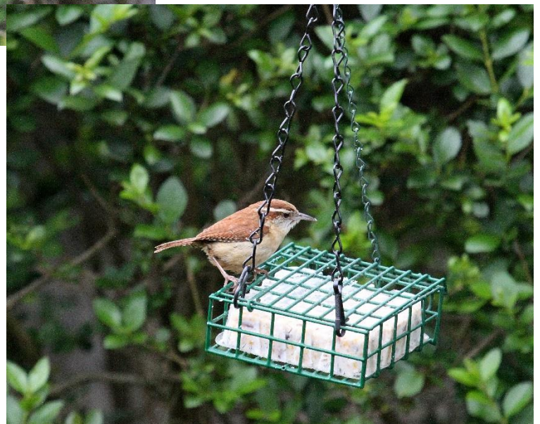
A Carolina Wren had the same dilemma. A bird had to hang underneath to get at the suet cake. This is a way to deter European Starlings.