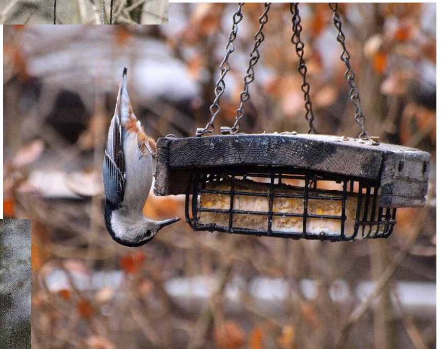
This White-breasted Nuthatch had an unusual way of getting at the suet.