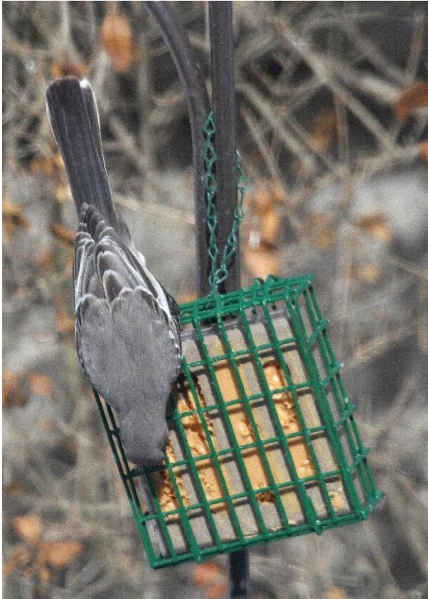
A Northern Mockingbird used the nuthatch's method of getting peanut butter at this feeder.