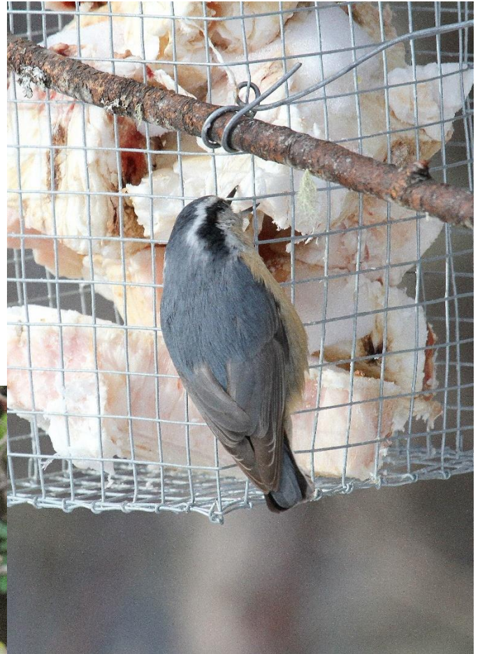
A Red-breasted Nuthatch grabbed a chunk of suet in Sax-Zim Bog.