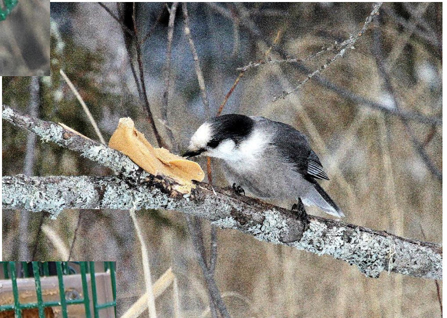
A Canada Jay in Sax-Zim Bog enjoyed peanut butter smeared on a branch by volunteers.