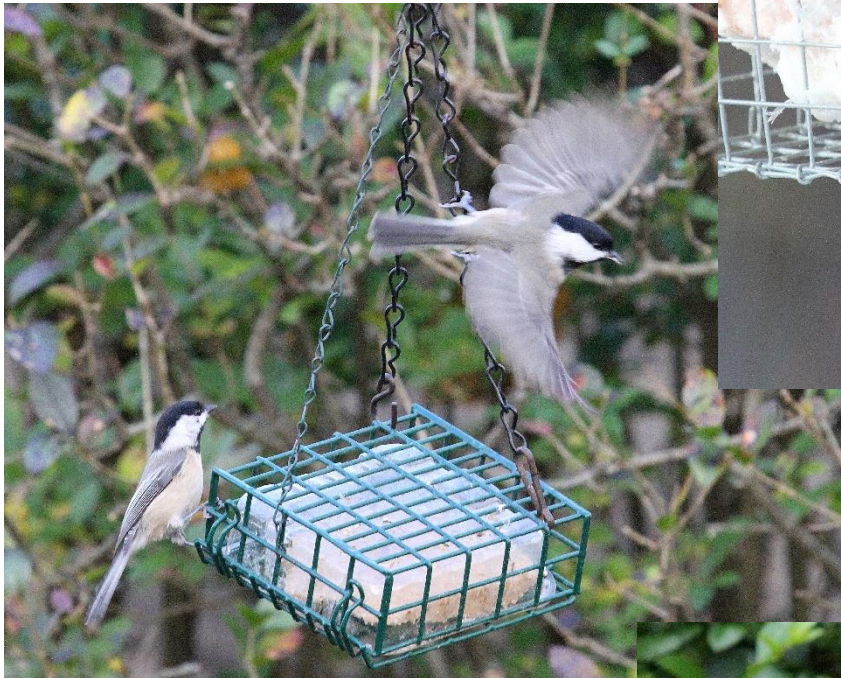
A pair of chickadees were frustrated by an upside down suet cake in a feeder. They couldn't peck through the plastic.