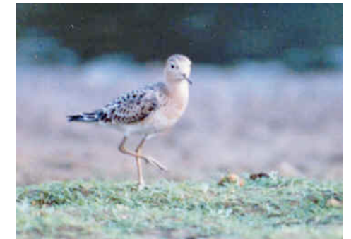
Buff-breasted Sandpiper 8-23-93