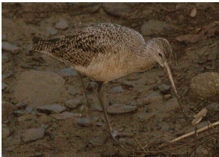
A Marbled Godwit found at Duck Hollow (Pittsburgh) on December 20, 2013. This shorebird is rare away from the coastline, but rarer still away from southern coasts and marshlands in December.