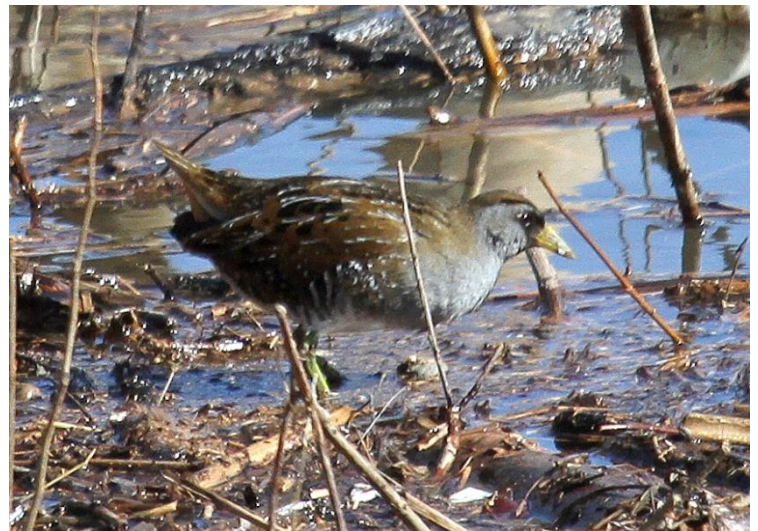
An extra-seasonal Sora spent most of February into March, 2017 at Duck Hollow (Pittsburgh) instead of at warmer southern or Gulf coast wetlands.