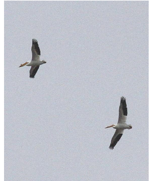
This pair of American White Pelicans flew over Duck Hollow (Pittsburgh) on April 2, 2016. They are rarely seen east of the Mississippi except in Florida during winter.