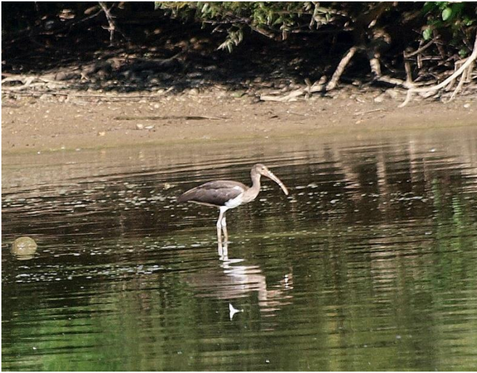
Juvenile White Ibis found at Shenango Lake, September 1, 2009, a shorebird normally found in southern coastal and inland marshes.

Nine Willets found at Duck Hollow (Pittsburgh), May 4, 2012.