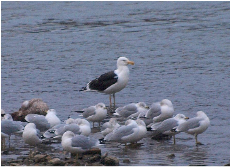
A Kelp Gull appeared at Duck Hollow (Pittsburgh) on January 18, 2015. This gull normally is found in the southern hemisphere in South America or Africa!!